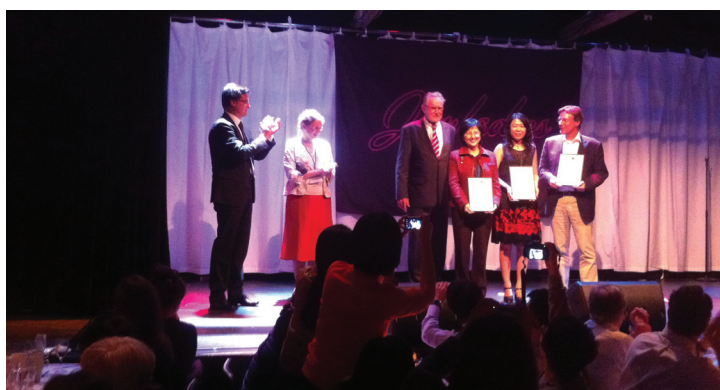
Last year’s winners in Gothenburg, Sweden.